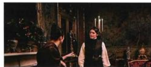
Gentleman Jack

Find out which rooms have featured on the big screen and hear some of the stories from behind the scenes.